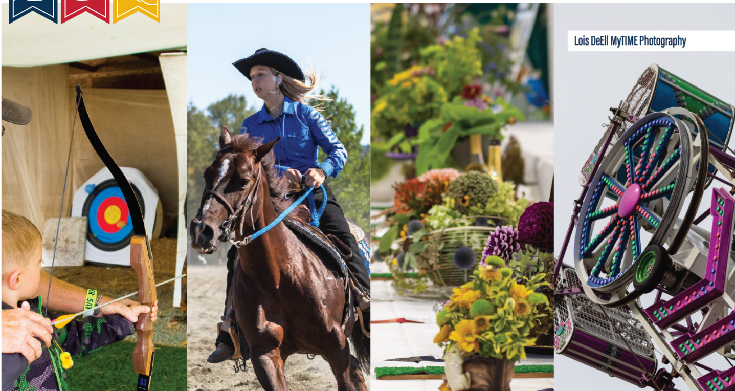
Lois DeEl MyTIME Photography